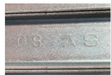
TAPERED FLANGE BEAM